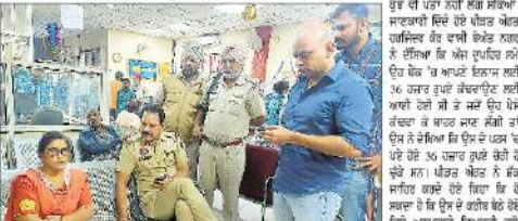
ਪੁਲਿਸ ਅੰਗਰ ਦੇ ਗਜ਼ਰਾਂ ਰੁਪਏ ਹੋਏ ਚੋਰੀ ਦੀ ਜਾਂਚ ਕਰ ਰਿਹਾ।

ਸਲੋਕ, 11 ਨਵੰਬਰ (ਪੁਲਿਸ) ਬੈਂਕ 'ਚ ਪੈਸੇ ਕੱਢਵਾਉਣ ਆਈ ਬਜ਼ੁਰਗਾਂ ਅੰਗਰ ਦੇ ਗਜ਼ਰਾਂ ਰੁਪਏ ਹੋਏ ਚੋਰੀ।