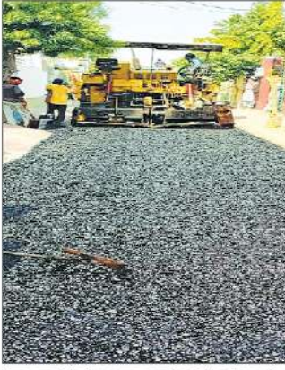
ਪੰਜਾਬ ਸਰਕਾਰ ਨੇ ਇਸ ਨੂੰ ਮੁਕੰਮਲ ਕਰਨ ਲਈ ਹੁਣ ਪਲਾਸਟਿਕ ਕੂੜੇ ਦੀ ਵਰਤੋਂ ਕਰਨ ਲਈ ਹੁਣ ਇਸ ਦੀ ਵਰਤੋਂ ਸੜਕਾਂ ਬਣਾਉਣ ਲਈ ਕੀਤੀ ਹੈ।